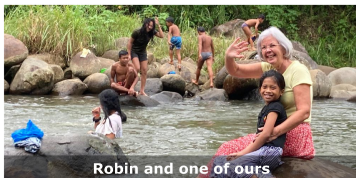
Robin and one of ours