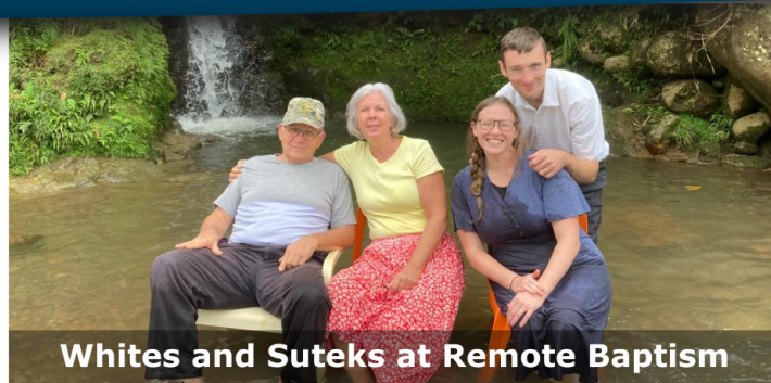
Whites and Suteks at Remote Baptism

We just put Bro. Hunter on a plane back to Manila having preached a four-day revival which had a very uniting affect. It is always right to get and stay right with the Lord and we needed it. We are now packed and ready for the LORD to return so keep looking up.